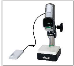
power supplied by charge pal