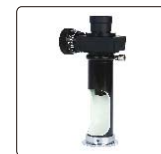
measuring microscope (included)