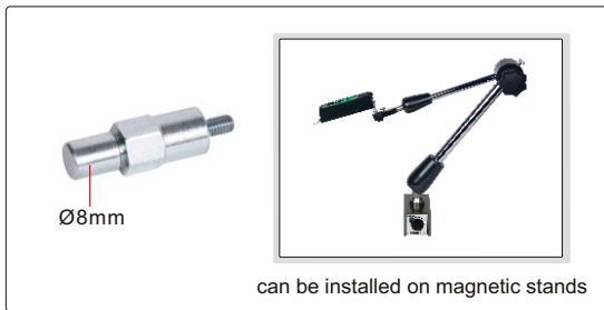
magnetic stand adapter (included)