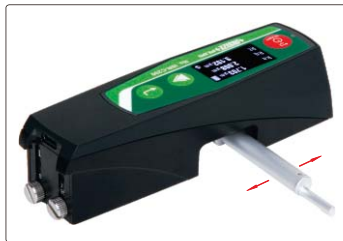
probe can be set at 90°, for transverse measurement