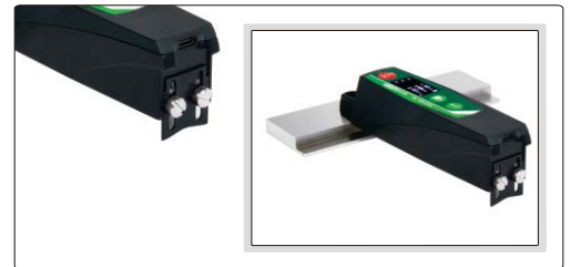
adjustable stand (included)