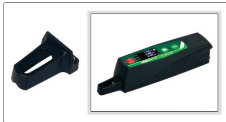
probe cover (included)