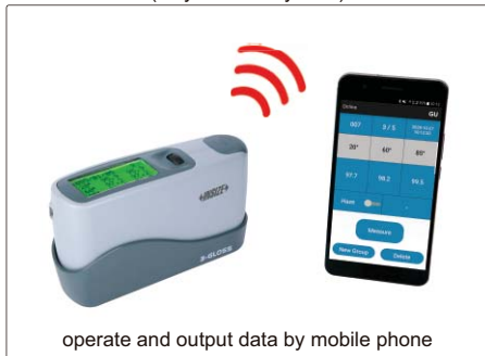
operate and output data by mobile phone

connect to mobile phone via bluetooth (only Android system)