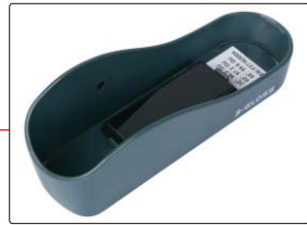
base with calibration block (included)