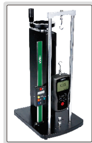
digital scale (optional)