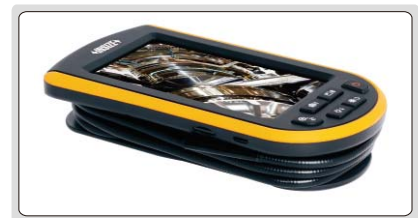
cable can be wrapped around the main unit