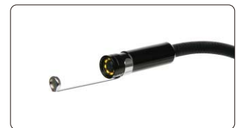
magnet pick up(included)